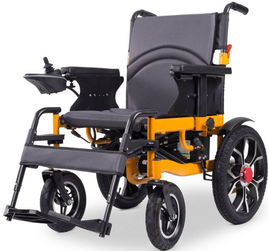
Specification - Electric Wheelchair

The OP-106S electric wheelchair is a smart innovative mobility chair which is collapsible to car boot size for transport, is great for travel, cruising and general indoor usage.