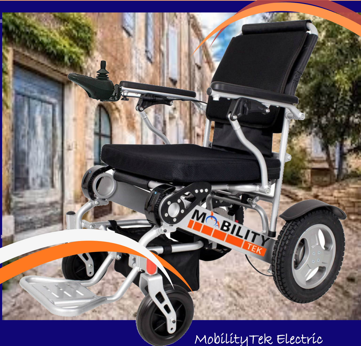
MobilityTek Electric Wheelchair

165 Currumburra Road Ashmore QLD 4214 Unit 6 (Showroom), Unit 2 (Workshop) sales@scooterland.com.au