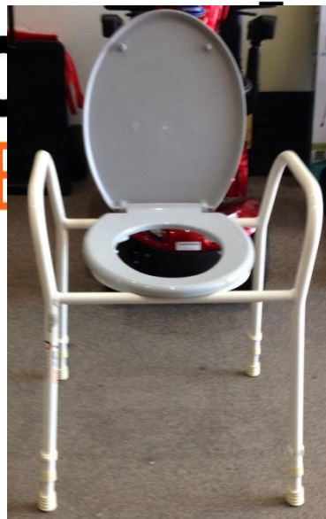
Over Toile Aid (OTA) c/w Seat and Lid