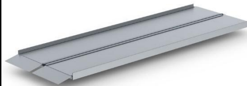
Portable Ramp – Dual Fold