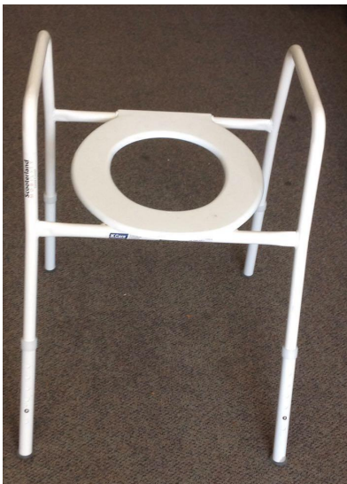
Over Toile Aid (OTA) c/w Seat and without Lid