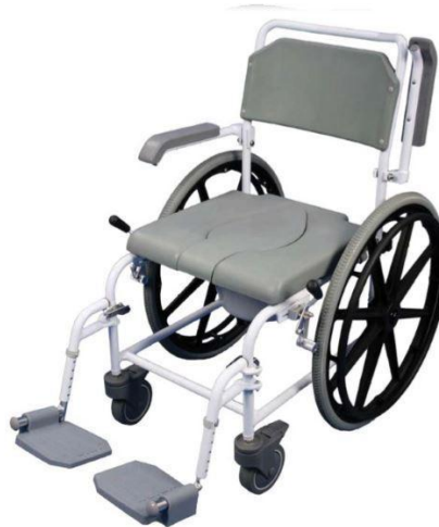
Stainless Steel Mobile Commode cum Shower Chair Self-propelled