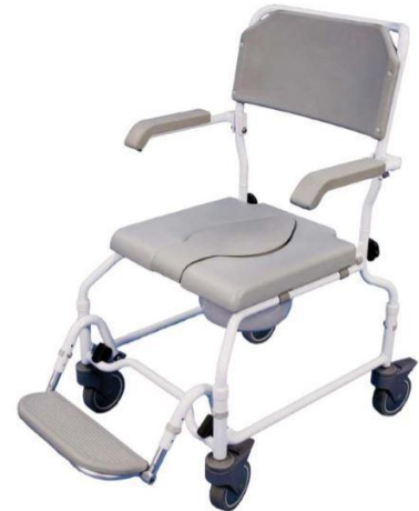
Mobile Commode cum Shower Chair Attendant propelled