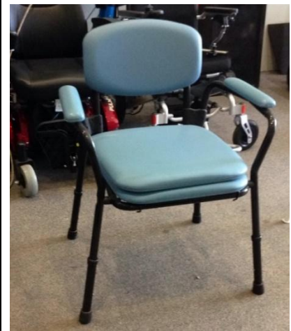
Bedside Commode cum Shower Chair