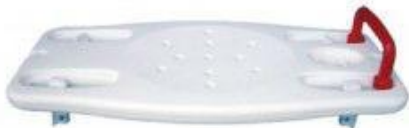
Bath Transfer Board