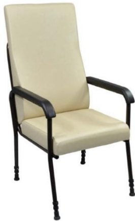
Day Chair - Hi Back