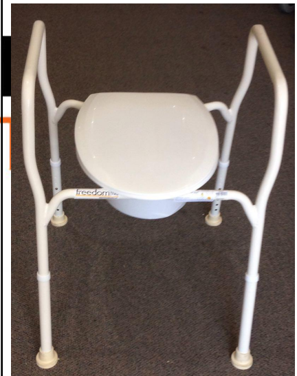
Over Toile Aid (OTA) c/w Seat, Lid and Splash Guard