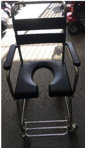
Stainless Steel Mobile Commode cum Shower Chair Attendant propelled