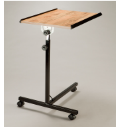
Over Chair Table