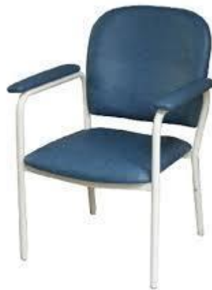
Day Chair - Lo Back