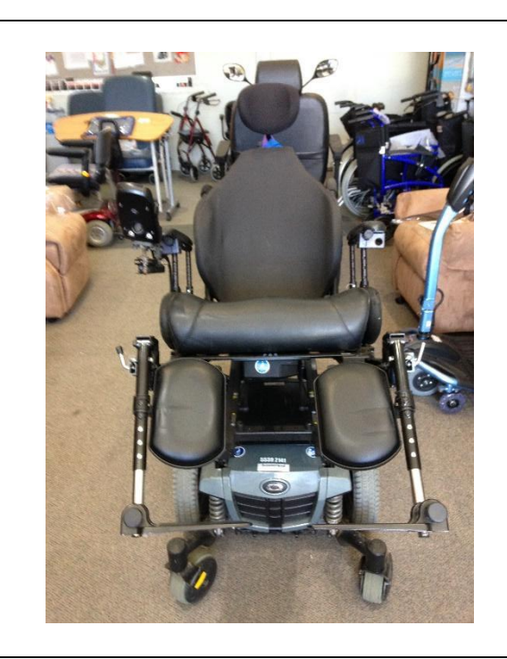
Standard Rehab Chair - Medium