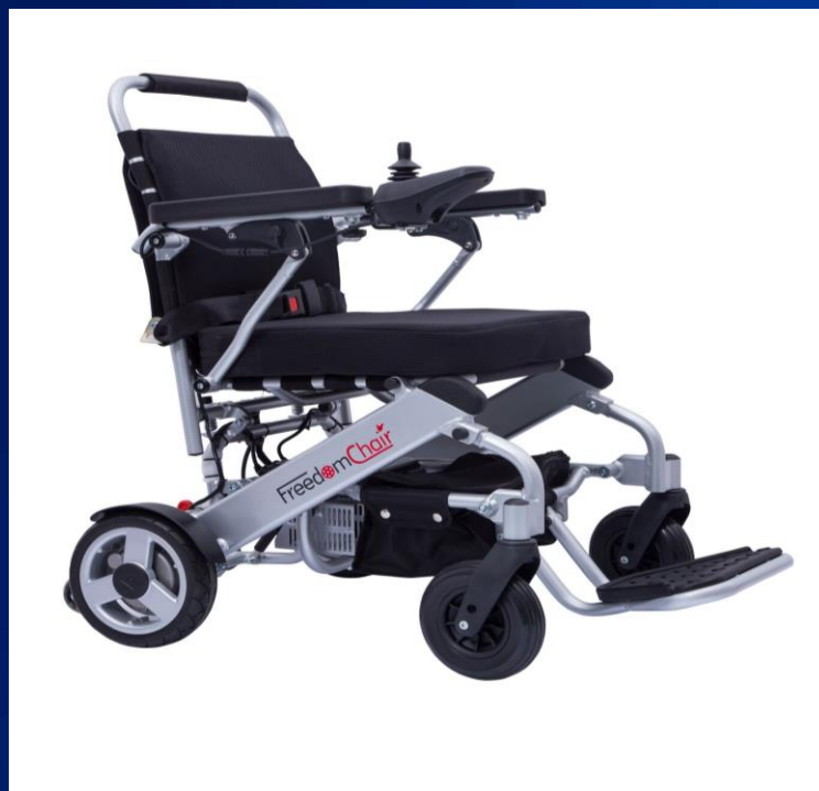
Model - A06 - Basic Chair

It is very important to read the Operating Instructions and Safety Guide prior to using the Freedom chair for the first time.