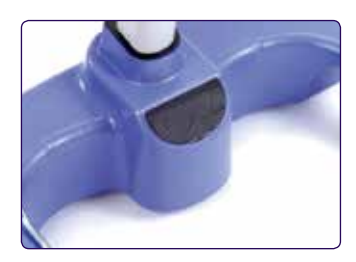
Foot 'push pad' helps reduce the force needed to initiate forward movement.

This view is shared by our clinical consultant team, who have assisted us in conducting detailed usability surveys to ensure the Presence meets the true needs of the patient, carer and the environment in which it operates.