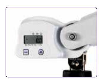
Digital weigh-scale (Class III)