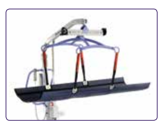
6-point adjustment cradle for use with a stretcher