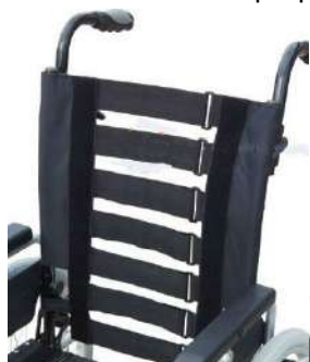
Excel G4 Wheelchair- AWC144/145/146 (Prescription)