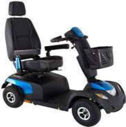
Invacare - Comet Alpine+