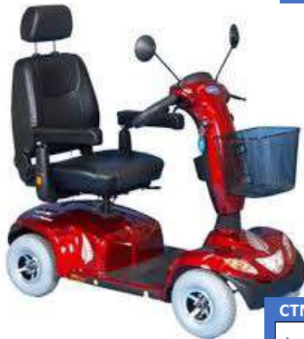
CTM HS 589