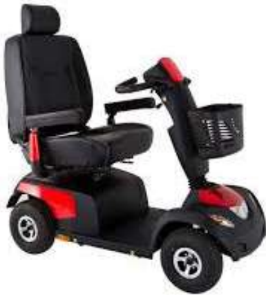
Invacare - Comet Ultra