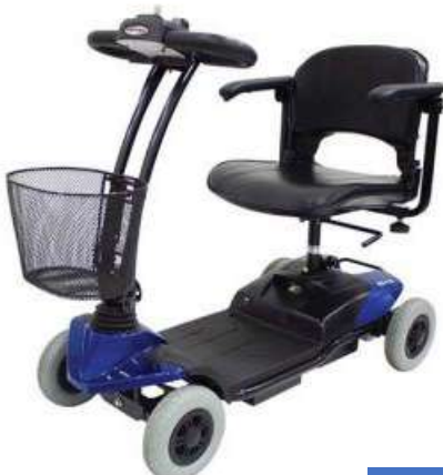
CTM HS 118/115