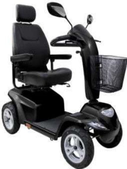
CTM HS 898 Bravo - Heavy Duty