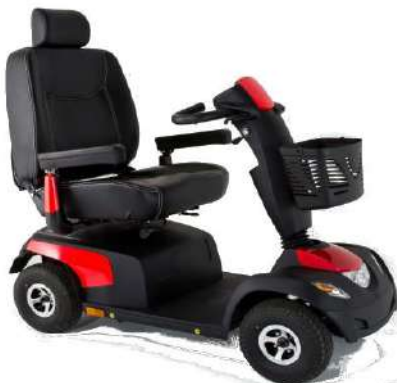
Invacare Pegasus Pro