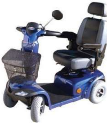
CTM HS 558