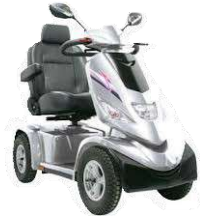
CTM HS 928