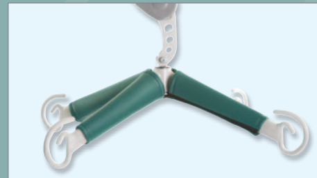
4 Point Yoke