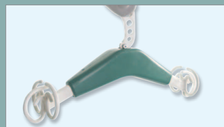
Tri Hook Yoke